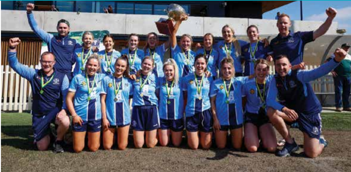
New South Wales Team