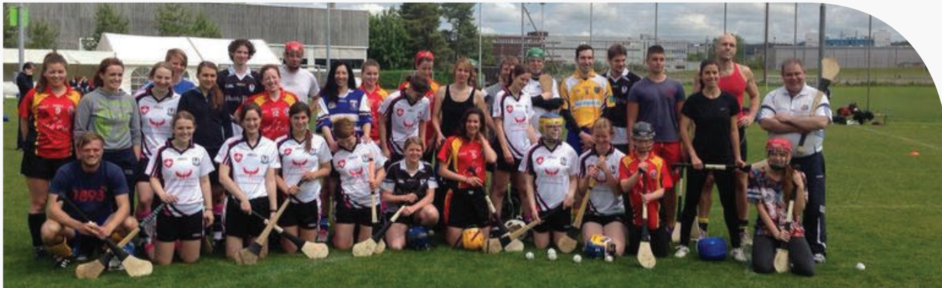
Zurich Coaching Workshop 2014