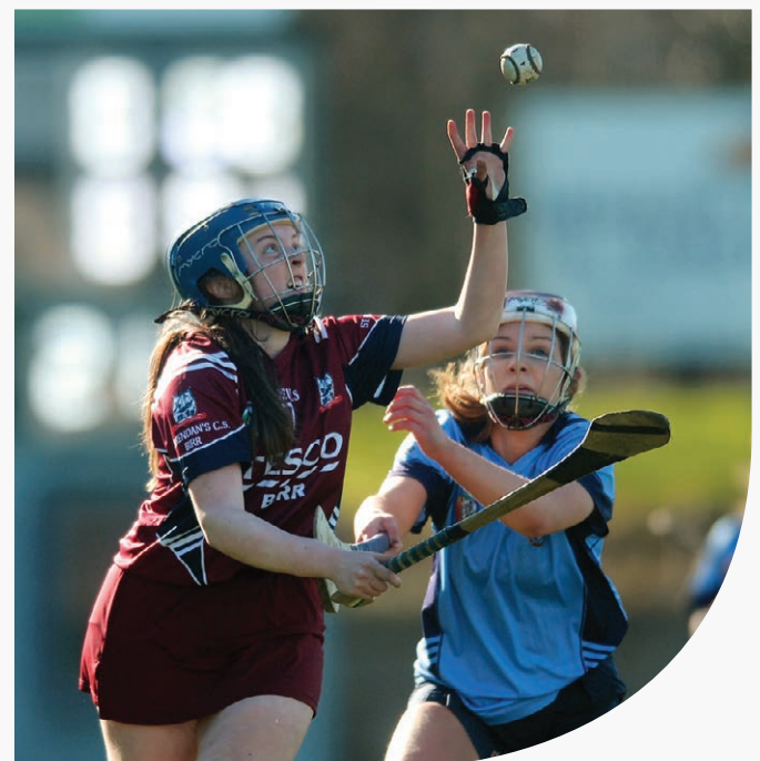
All Ireland Post Primary Junior A Final action - St. Brendan's (Birr) v St.Mary's (Charville)