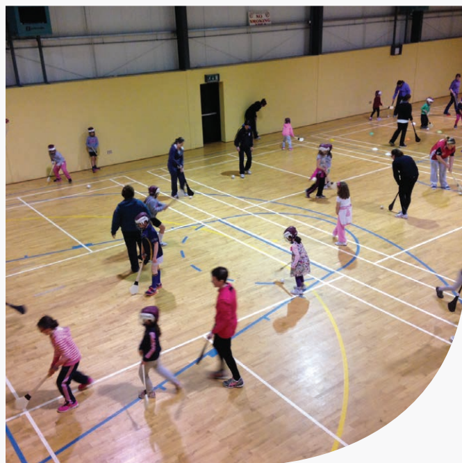
Mum and Me programme, Longford.