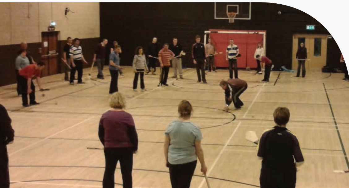
Coaching workshop Galway.