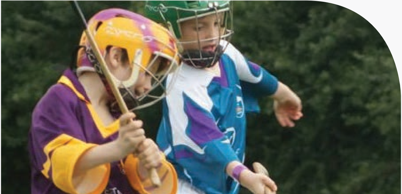
Action from the All Britain Championships