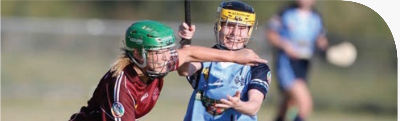
Australasian Championships Semi Final - Queensland and Western Australia in action