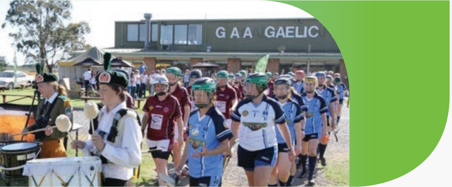
Australasian Championships Final – Queensland and New South Wales take to the field at Gaelic Park