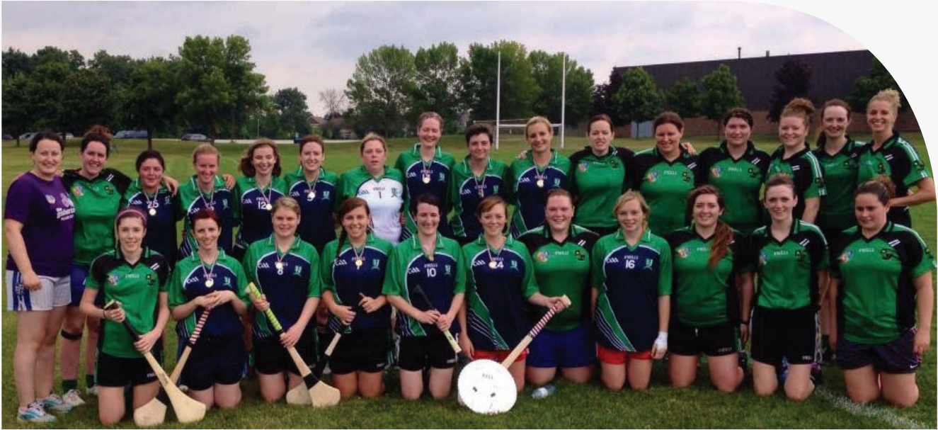
Toronto, League Finalists 2014.