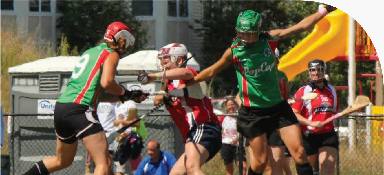
Denver Gaels vs Seattle